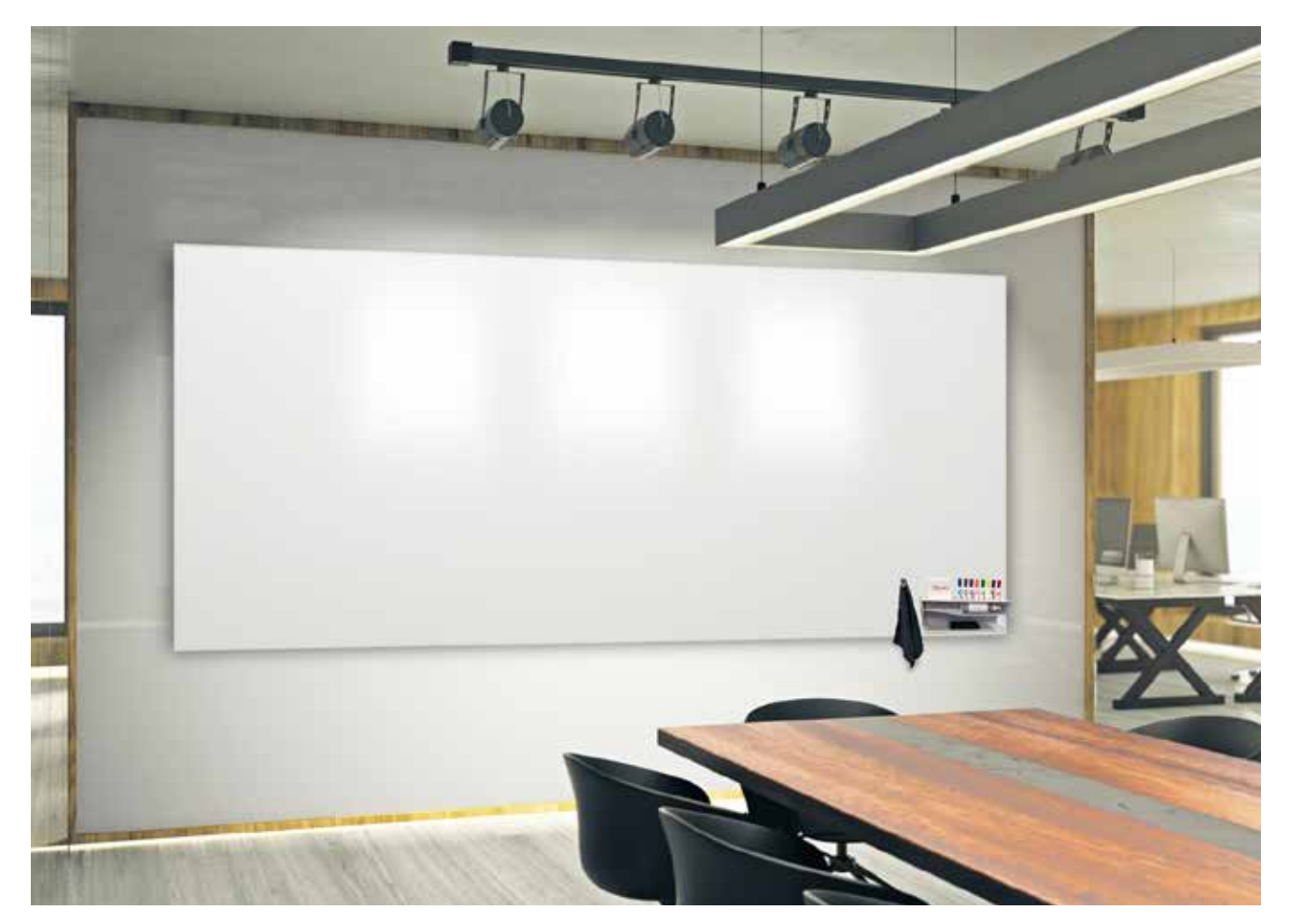
Merge frameless markerboard in either knife edge or square edges.