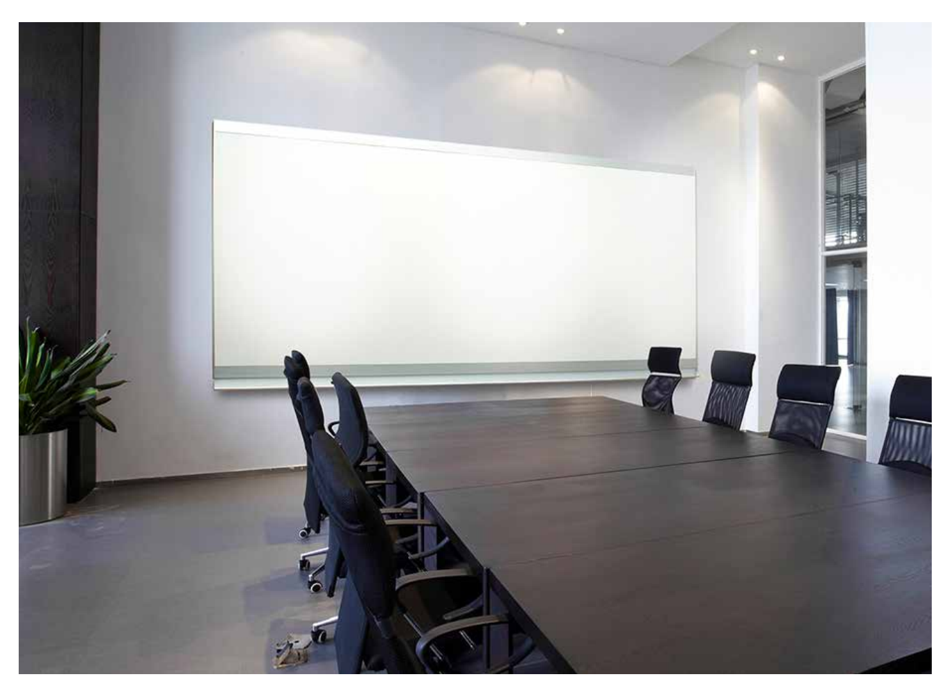
VIP Markerboards in porcelain enamel steel that always cleans to like new.