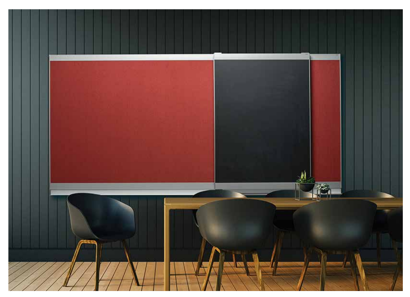
VIP Noticeboard available with markerboard, chalkboard and fabric Component Boards.