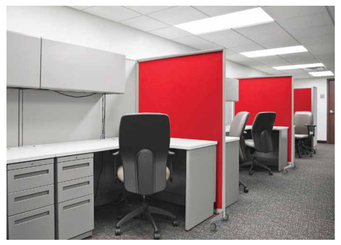
elements Series Mobile Board Dividers Tri-Leg in fabric or porcelain.