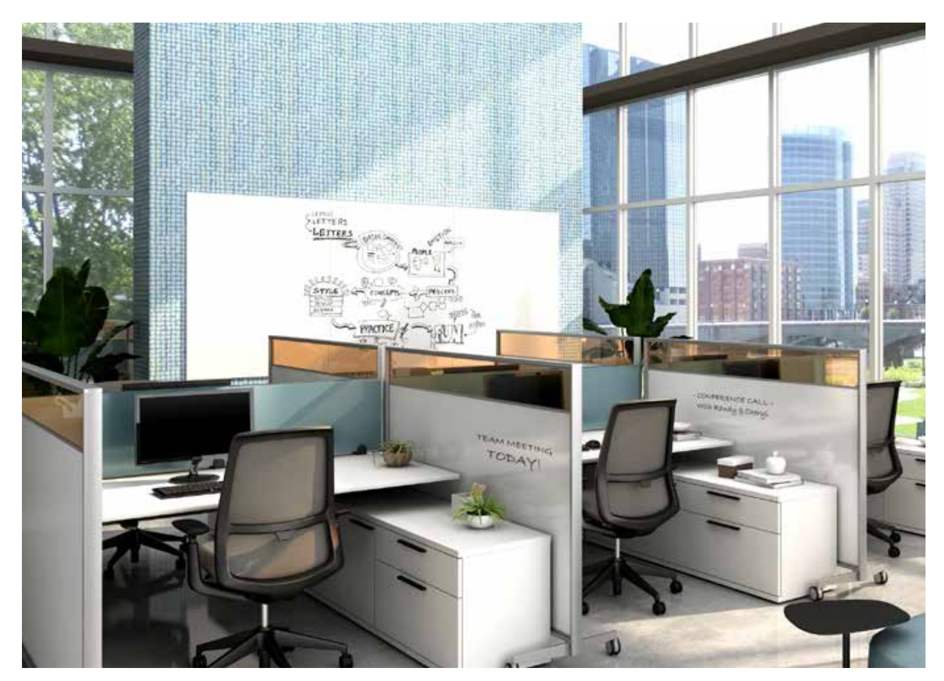
elements Series Mobile Board Dividers Tri-Leg with porcelain markerboards and decorative glass inserts.