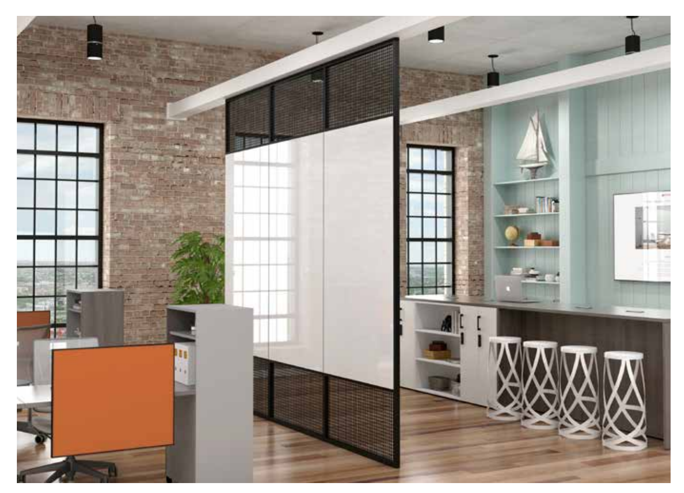
Intersection Mesh—a divider system with porcelain boards, metal mesh and powder-coated frame