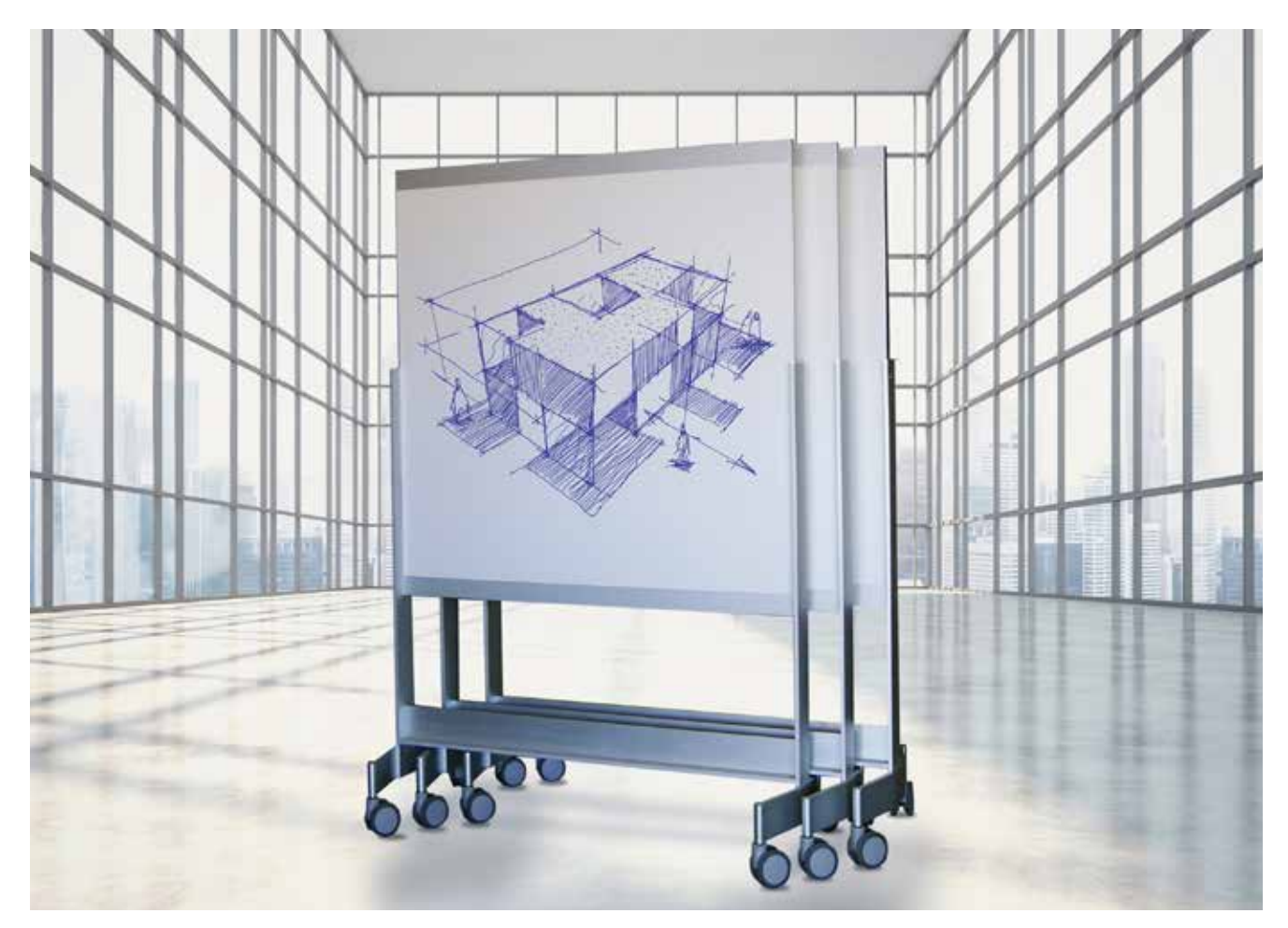
VIP Series magnetic two-sided Mobile Markerboards in porcelain steel with heavy duty frame and casters.