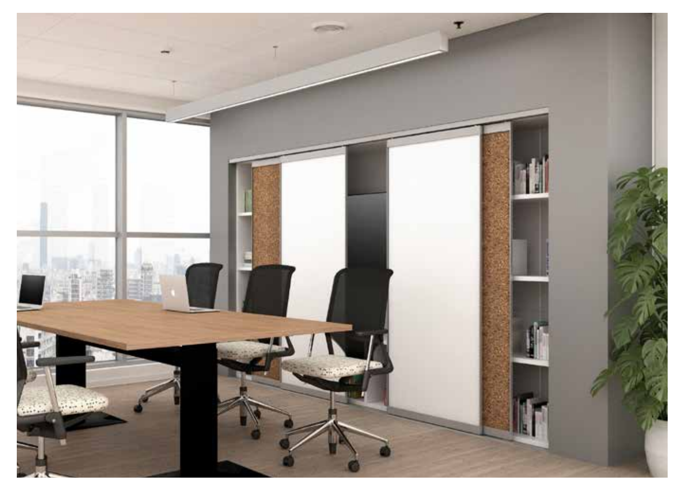
VIP+ Series Sliding Panel System, floor-to-ceiling porcelain markerboards/cork.