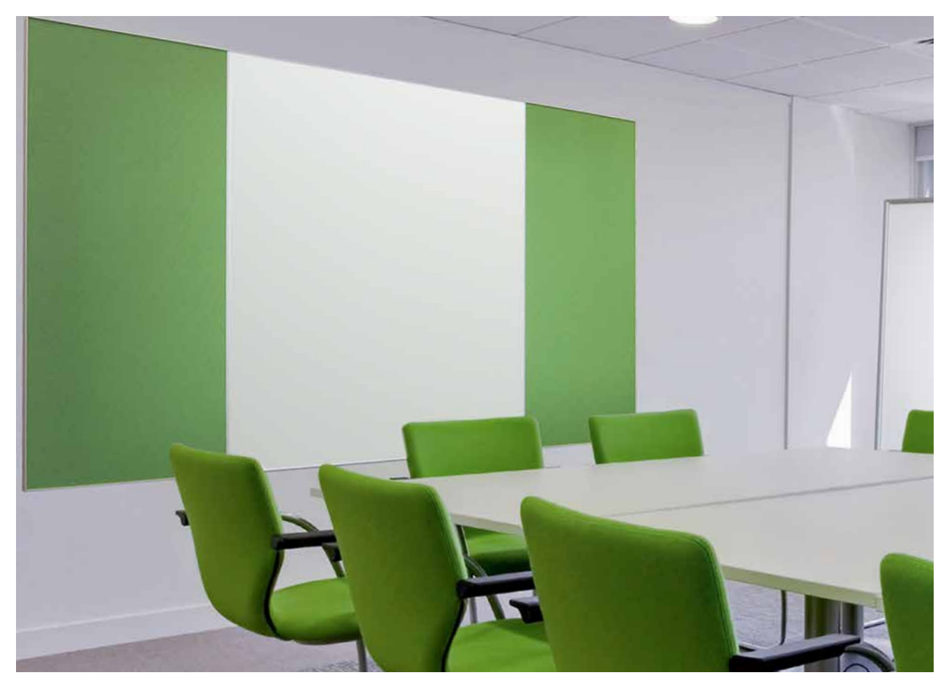
elements Series Combiboards combine porcelain markerboards and fabric.