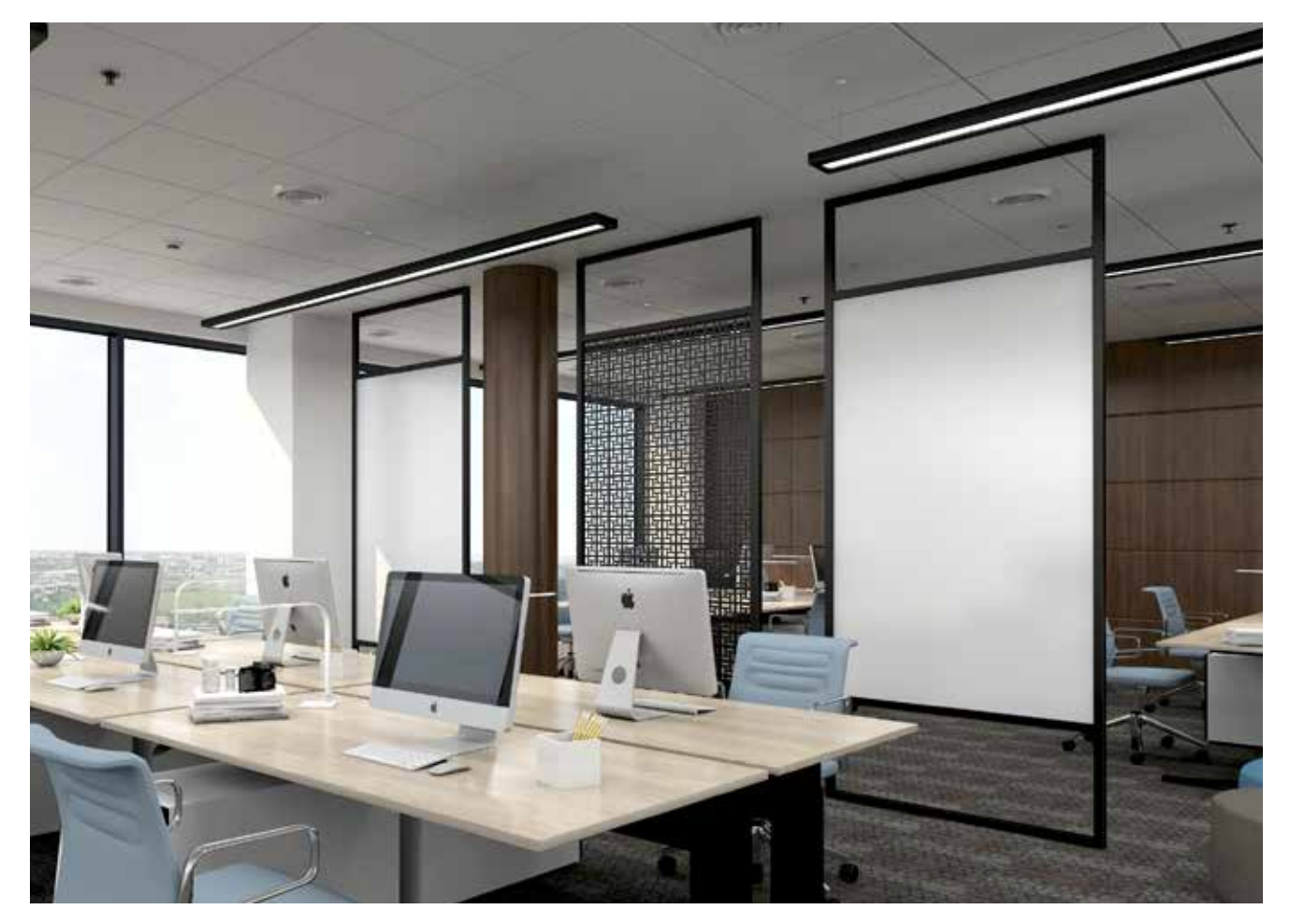
Intersection Single Panels—a divider system w/porcelain boards, custom metal inserts and black aluminum frames.