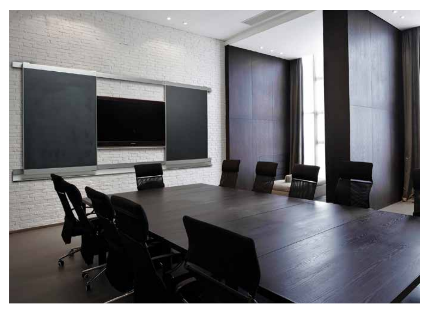
VIP Series Media Wall—Component Boards in porcelain and fabric create elegant presentation walls for both Digital and Analog tools.