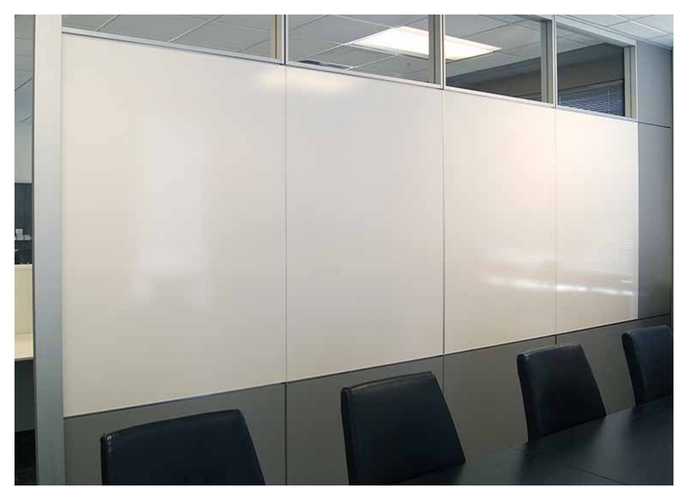
Inserts for third-party modular walls, in forever-warrantied porcelain steel markerboards or chalkboards.